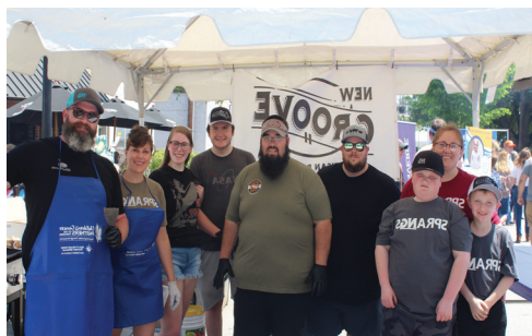
New Groove, 2022 Winner